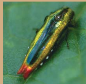
Agrilus furcillatus Chevrolat