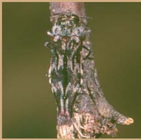
Agrilus (Agrilomorpha) spathulatus (Obenberger)