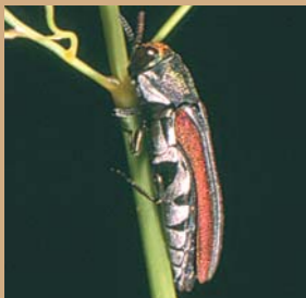
Agrilus (Engyaulus) pulchellus Bland