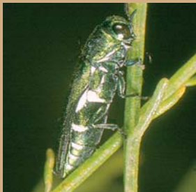
Agrilus (Engyaulus) inhabilis chalcogaster Van Dyke