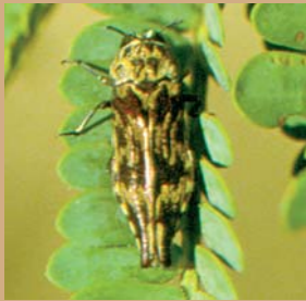
Agrilus (Agrilomorpha) venosus Gory & Laporte