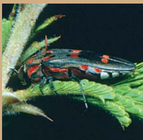
Agrilus (Personatus) dewetti Obenberger