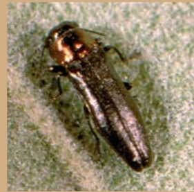
Agrilus angelicus Horn