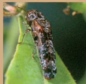
Pilotrulleum lagartiguanum Bellamy & Westcott