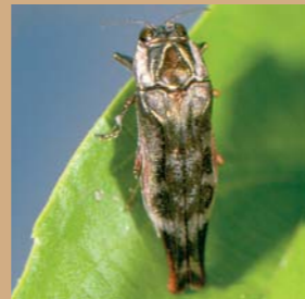
Agrilus cavifrons Waterhouse