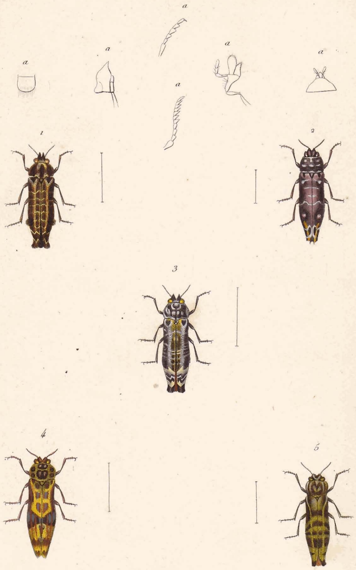
Fig. a. Caract. du ♂ Amorphosoma. Amorph. exasperatum.